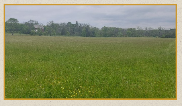
Wildflowers in bloom, the bank barn in the distance.