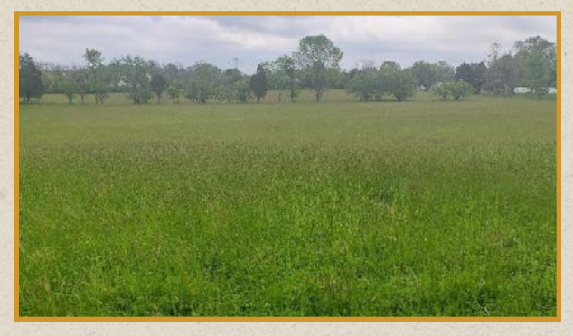
The Milestone development lies a half-mile to the east, just beyond the trees.

In the coming months Worcester Township will begin to discuss potential uses and improvements to be made at this property. Updates will be included in future newsletters.