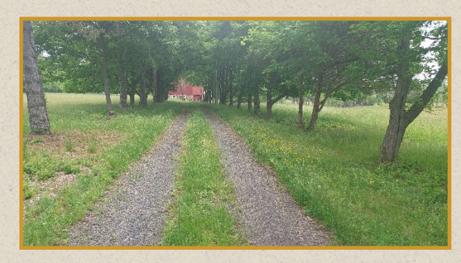
Treelines border the entrance drive.