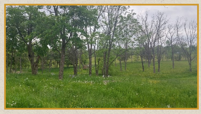
A small creek meanders through the property.