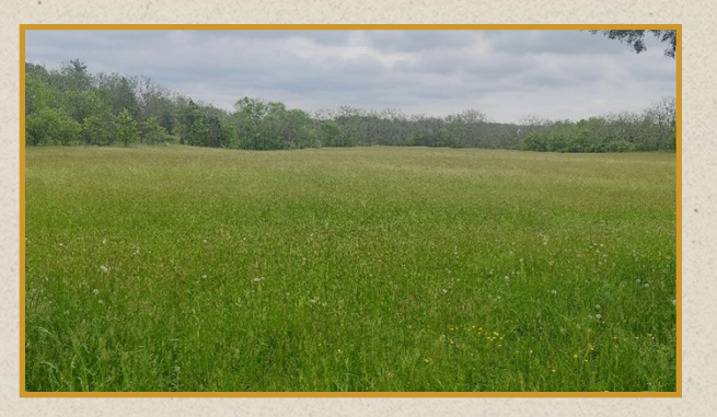
Rolling fields, looking northeast from Fisher Road.