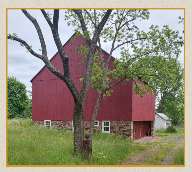
A stunning Pennsylvania bank barn centers the property.

In the coming months Worcester Township will begin to discuss potential uses and improvements to be made at this property. Updates will be included in future newsletters.