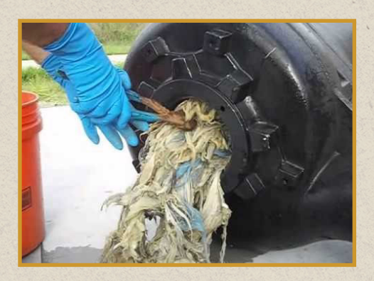
All varieties of wipes will clog sewer lines and damage grinder pumps!

Please toss used wipes into the trash can ... and use a plastic bag to contain used wipes for extra security.